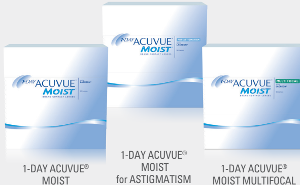
1-DAY ACUVUE® MOIST