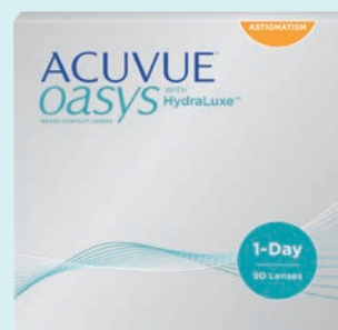
ACUVUE® OASYS 1-Day with HydraLuxe® Technology for ASTIGMATISM