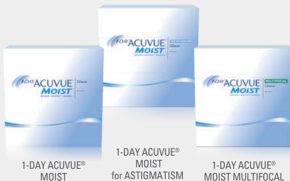
1-DAY ACUVUE® MOIST